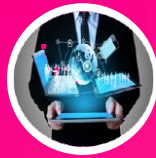
COO and IT Advisory Partner of Goyield

Founding partner of Pantalica Partners, with more than 16 years of experience in turnaround/financial restructuring processes, he was responsible for the financial restructuring area at PwC in 2013, where he worked in large turnaround processes within and outside the context of tender procedures